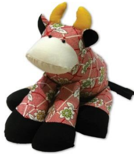
Patty the COW