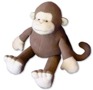
Mitch the MONKEY