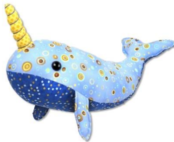
Nate the NARWHAL