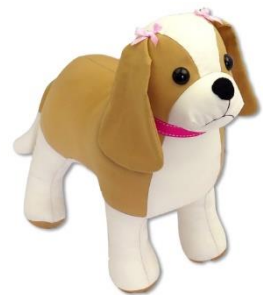
Poppy the PUPPY