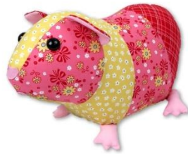
Gertrude GINNY PIG