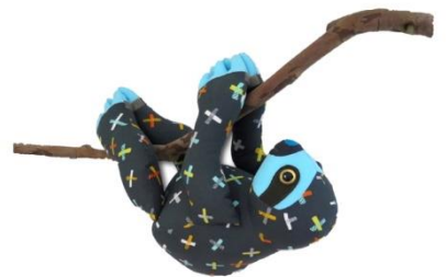
Sowpoke the SLOTH