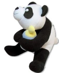
PANDA BABY Ning