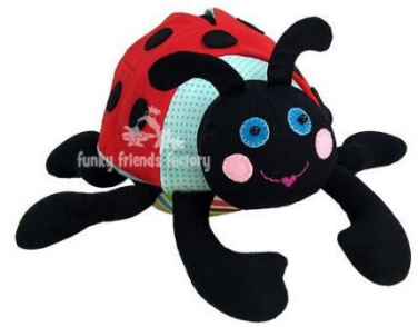
Lily The Ladybug