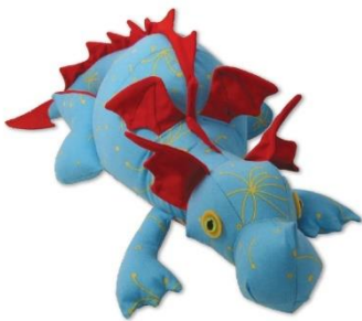
Diggles the DRAGON