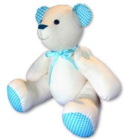
Calico SIGNATURE BEAR