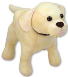
Lucky the LABRADOR