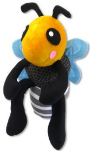
Bumble the BEE