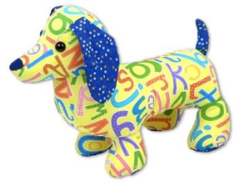
Digger & Dixie DACHSCHUND