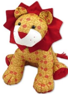
Larry the LION