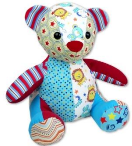
Melody Memory BEAR