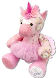
Kelsey KEEPSAKE Unicorn