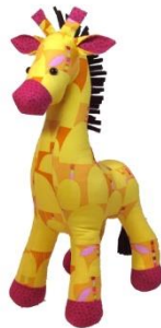
Raff The GIRAFFE