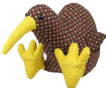
Kiri the KIWI