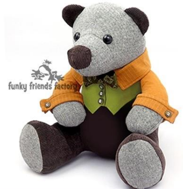
Meet BUTTONS the BEST DRESSED Bear