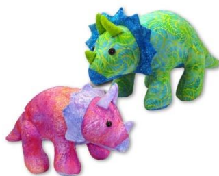
Trixan & Trixie TRICERATOPS