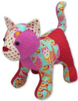
Patch the PUSSY CAT