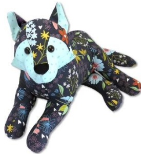
Winsome the WOLF