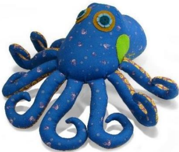
Ozzie the Octopus