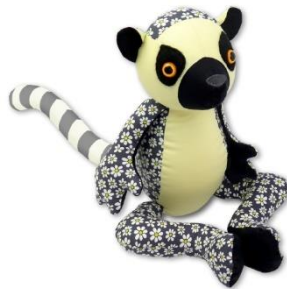
Licorice the LEMUR