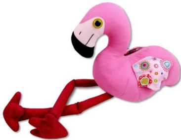
Fleur the FLEMINGO