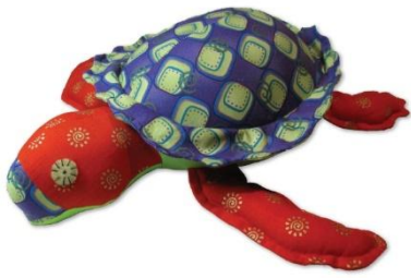
Stu the SEA TURTLE