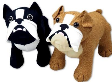
Butch & Bella BULLDOGS