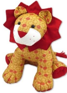
Larry the LION