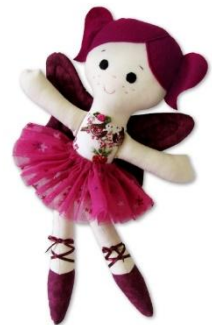
Sugar Plum FAIRY