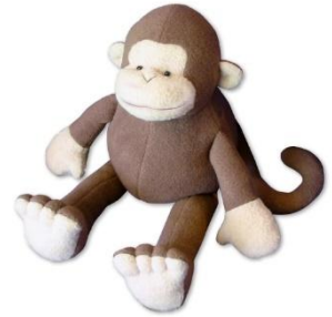
Mitch the MONKEY